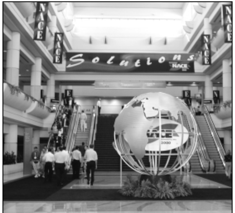
NACE convention in Orlando