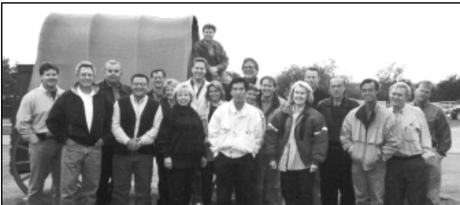
The best team in the business

Nineteen AWC managers met at Garrett Creek Ranch, in Paradise, Texas recently to plan for 2001. Included in the discussions were innovative ways for AWC customers to meet the challenges of our dynamic industry. Look for new programs in 2001 designed to continue our leadership.