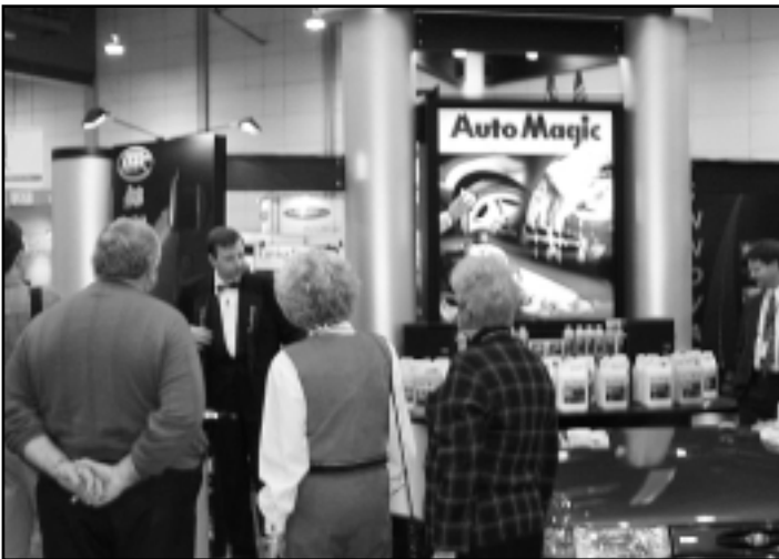
"Magic" at the Auto Magic® exhibit