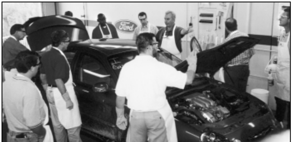
Manheim, Ford and Auto Magic ® share ideas

The Auto Magic ® National Training Center was the site last fall of a special auction class held for representatives of Manheim Auctions and the Remarketing Department of FORD Motor Company. Included in the 2 day agenda were discussions dealing with reconditioning techniques and new Auto Magic ® products for removal of water spots from paint and glass.