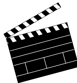
Lights, camera, action