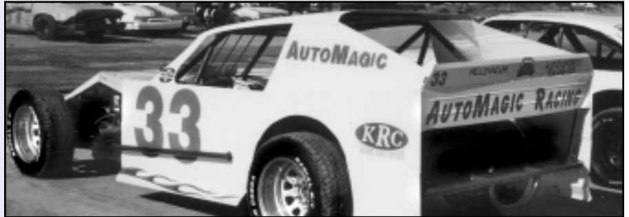
One owner...low miles