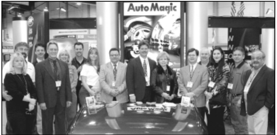
Council members and wives tour NADA convention

The latest meeting of the Auto Magic ® Advisory Council took place, February 2-4 in Las Vegas during the annual National Automobile Dealer's Association convention. Council members and their wives were guests at Auto Magic ® 's exhibit and met with senior managers of AWC to discuss new product introductions and research and development projects underway at AWC. Council members serve a two-year term and are elected by distributors in respective regions.