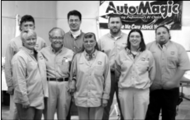
The Guard Sales - Auto Magic® team