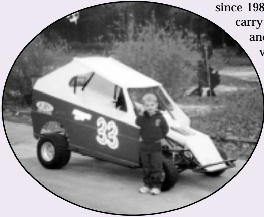
Wait for me, Dad!